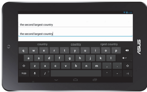
Figure 2. The device and the application used during the study.