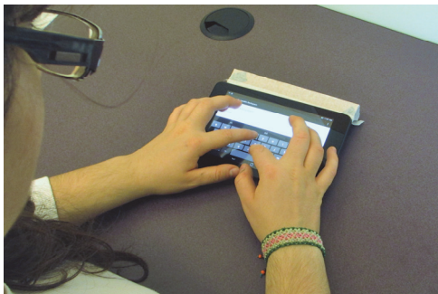
Figure 3. A participant inputting text using the custom application during the pilot study.

(highlighted with underline), and the second most probable one in the right. See Figure 2. It allows users to input a predicted word by pressing the space key, which will input the highlighted candidate, or by tapping on the intended word in the panel. In case of a likely misspelled word, the system autocorrects it with the most probable correct one (i.e. the underlined candidate), unless the user override this by tapping on the original text in the panel (i.e. the left candidate). Users can also replace an auto-completed/corrected word with the original one by pressing the backspace key immediately after the prediction was entered. We informally tested our system with several experienced Android users and none of them noticed differences between our custom and the default prediction.